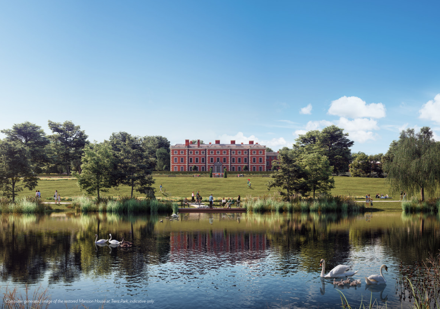
Computer generated image of the restored Mansion House at Trent Park, indicative only.