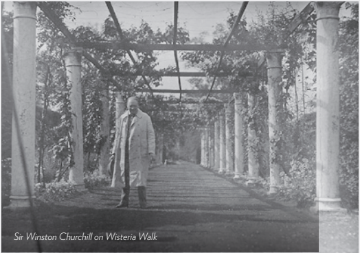
Sir Winston Churchill on Wisteria Walk

Politicians, Prime Ministers, royalty and famous personalities frequented these stately grounds and grand rooms. For some, it was a weekend retreat to revel in divine company and a place to be wowed and entertained. Sir Winston Churchill pictured in the photograph below at the original Wisteria Walk.