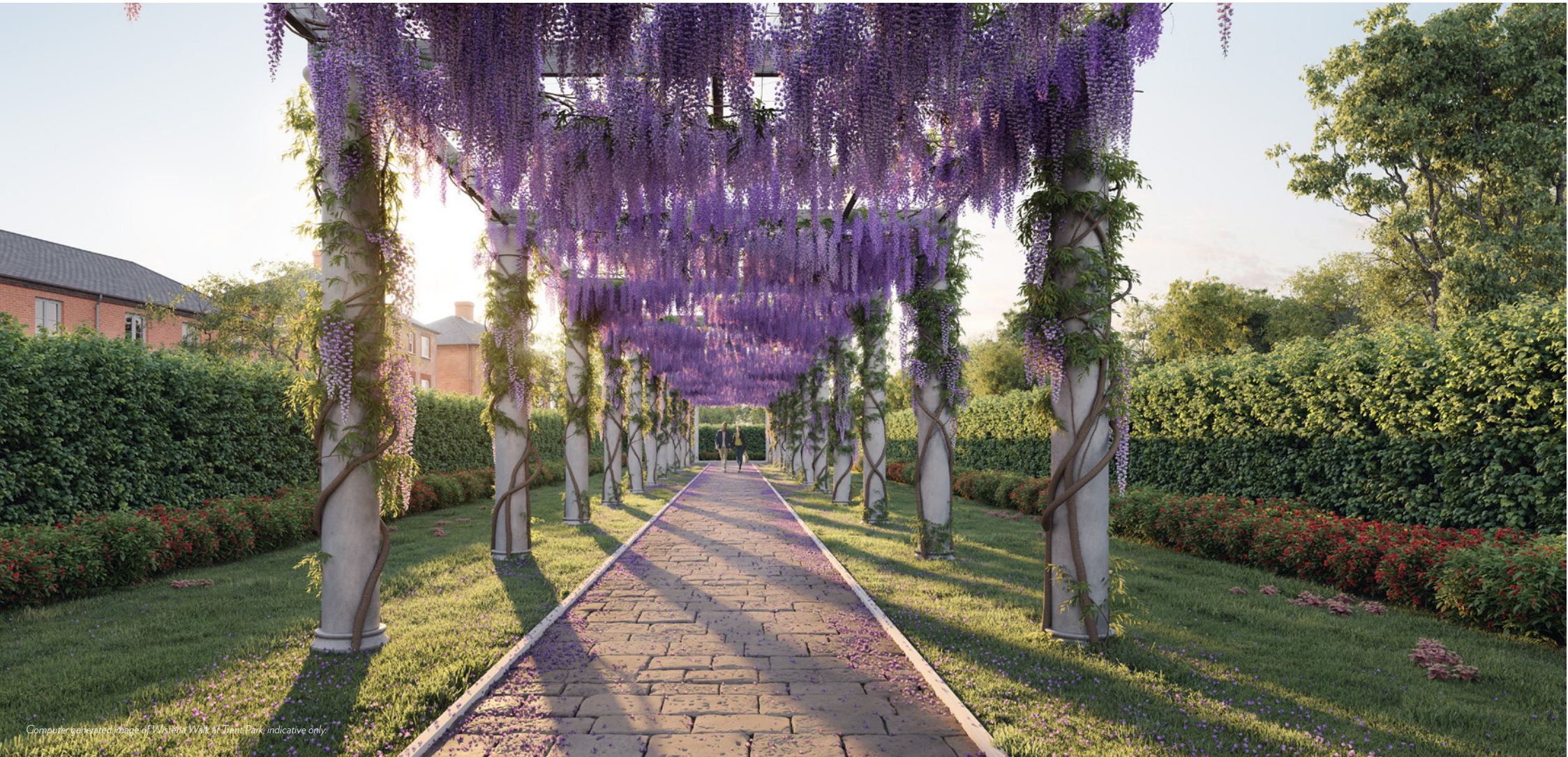
Computer generated image of Wisteria Walk at Trent Park, indicative only.

The restoration of WISTERIA WALK includes the refurbishment of the York Stone path and pink marble columns .