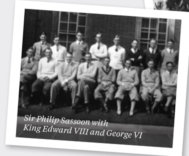
Sir Philip Sassoon with King Edward VIII and George VI