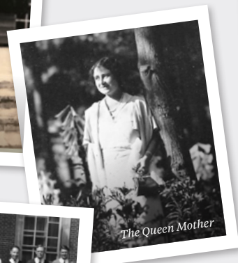
The Queen Mother