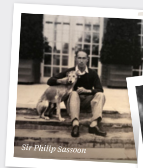
Sir Philip Sassoon