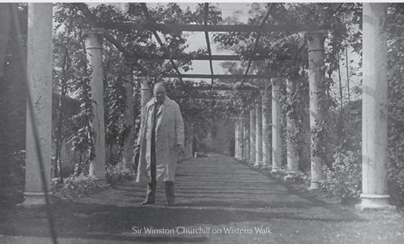
Sir Winston Churchill on Wisteria Walk

A GUIDE AND INSIGHT INTO TRENT PARK'S RICH HISTORY