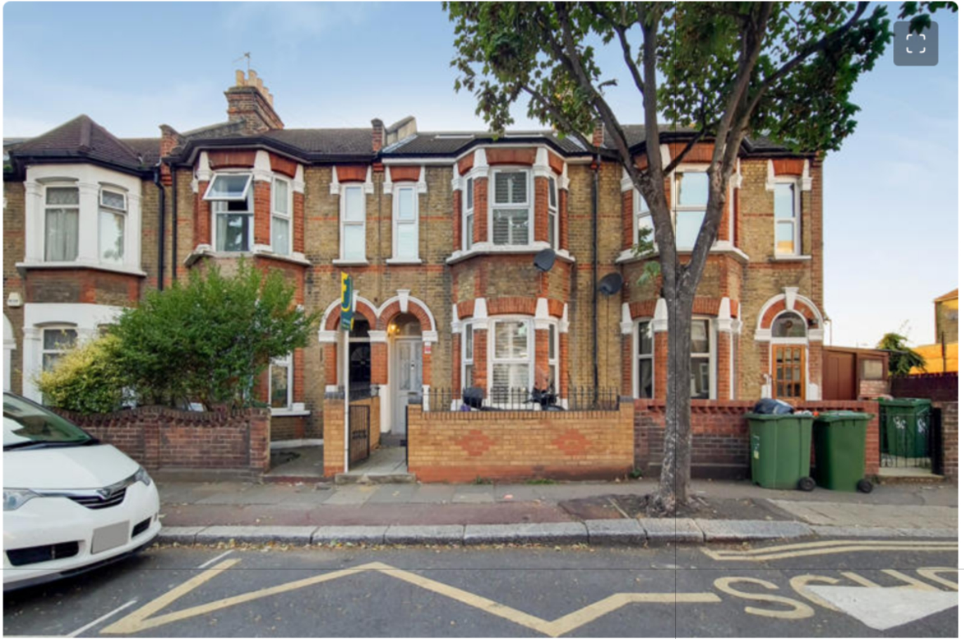
Top rung

This tastefully refurbished Victorian terraced house has five bedrooms, three bathrooms, a 39ft-long kitchen/living room, an outbuilding and basement.