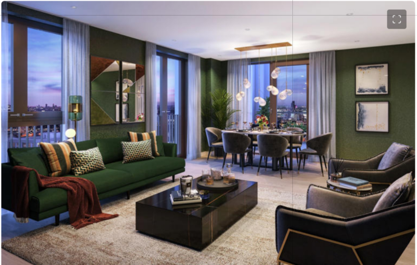
The Penthouse at TwelveTrees Park

Evergreen Point, the inaugural building, is a 32-storey tower made up of one, two and three-bedroom apartments with a gym, screening room, business lounge and 24-hour concierge, from £527,500, TwelveTreesPark.london. Phase one will include 229 shared ownership homes and 99 for affordable rent from housing association Peabody.